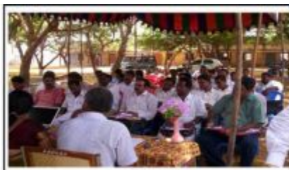
Participation of 105 Partner NGOs